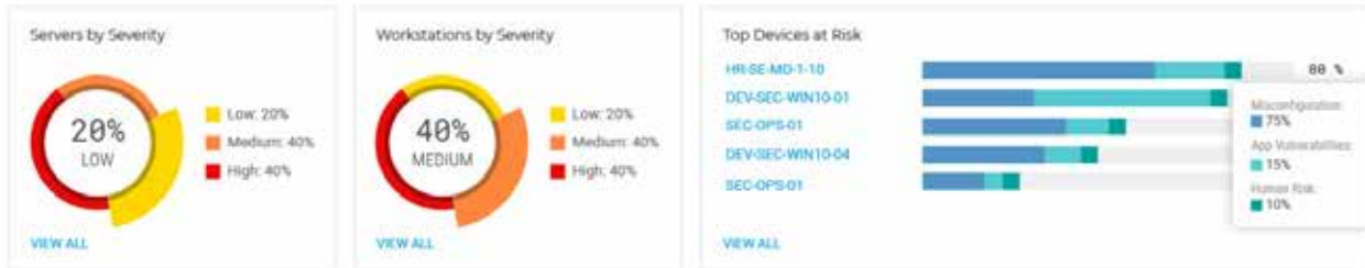
GravityZone Elite Risk Management Dashboard: Risk Severity by Endpoint Type