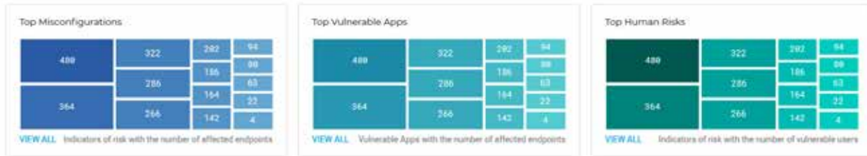
GravityZone Elite Risk Management Dashboard: Misconfigurations and Vulnerable Apps